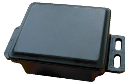
With mounting brackets (flange)

The AssetTrack Mini is a small, discreet tracker that is easily concealed. This tracker utilizes the largest and most reliable 4G LTE cellular networks to maintain a stable connection to our servers from virtually anywhere in the United States. The AssetTrack Mini offers up to 5 years of battery life with one location update per day. The tracker allows you to see where your assets are spending the most time, and with easily modified reporting modes, you can increase the frequency of location updates at any time from any location.